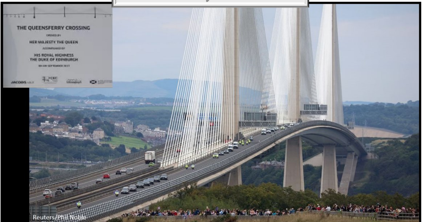
The funeral cortege of HM Elizabeth II travels over the Queensferry Crossing on its way to Edinburgh. The Late Queen opened this same bridge in 2017.